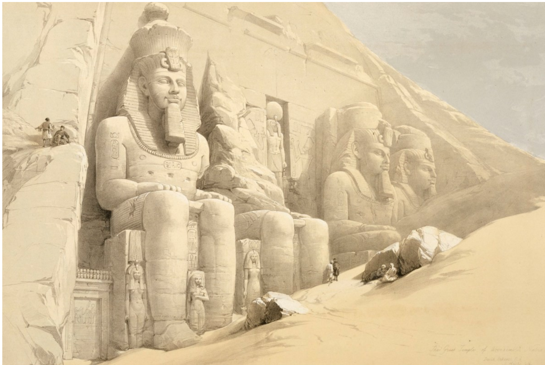
The Great Temple of Unas at Saqqara Doris Roberts, 1888 Plate 24